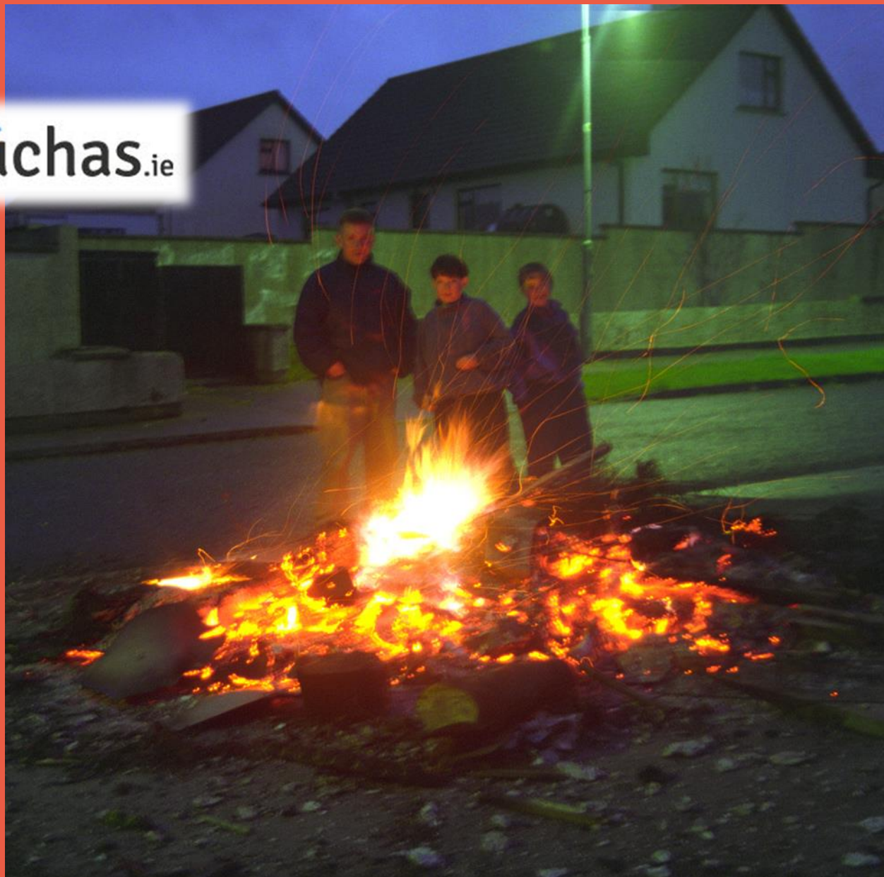
Bonfires on the evening of May Day, Sligo town (Bairbre Ní Fhloinn 1995)